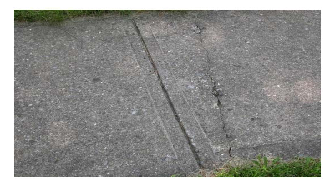
Figure <sup>£</sup> A crack next to a too-shallow joint

or a crack control joint to be effective, it should be \frac{1}{4} as deep as the slab is thick. That is, on a typical four inch thick slab, the joints should be no less than one inch deep; a six inch thick slab would require 1.\circ inch deep joints, etc. To minimize the chances of early Random cracking, these joints should be placed as soon as possible after the concrete is poured. If the control joint is not deep enough, the concrete can crack near instead of in it Crack (See Figure \frac{1}{2} )