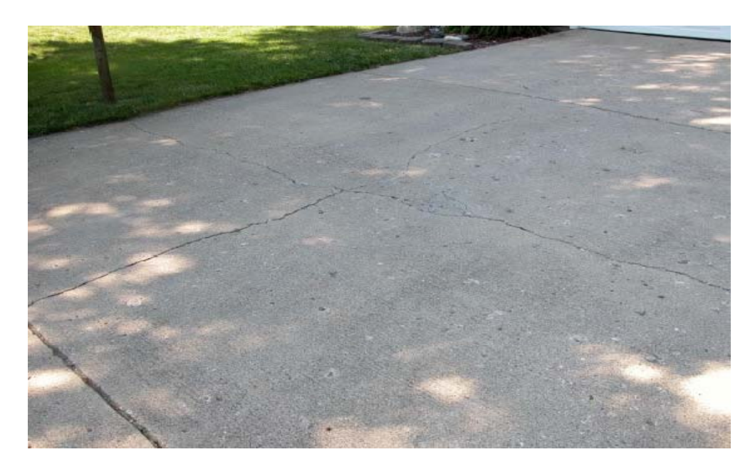
Figure ° Driveway cracks where jointsshould have been placed

Another reason that concrete cracks is expansion. In very hot weather a concrete slab, like anything else, will expand as it gets hotter. This can cause great stress on a slab. As the concrete expands, it pushes against any object in its path, such as a brick wall or an adjacent slab of concrete. If neither has the ability to flex, the resulting force will cause something to crack. An expansion joint is a point of separation, or isolation joint, between two static surfaces. Its entire depth is filled with some type of compressible materialsuch as tar-impregnated cellulose fiber, closed-cell poly foam, or even lumber See Figure <sup>¬</sup>). Whatever the (compressible material, it acts as a shockabsorber which can "give" as it is compressed. This relieves stress on the concrete and can prevent cracking.