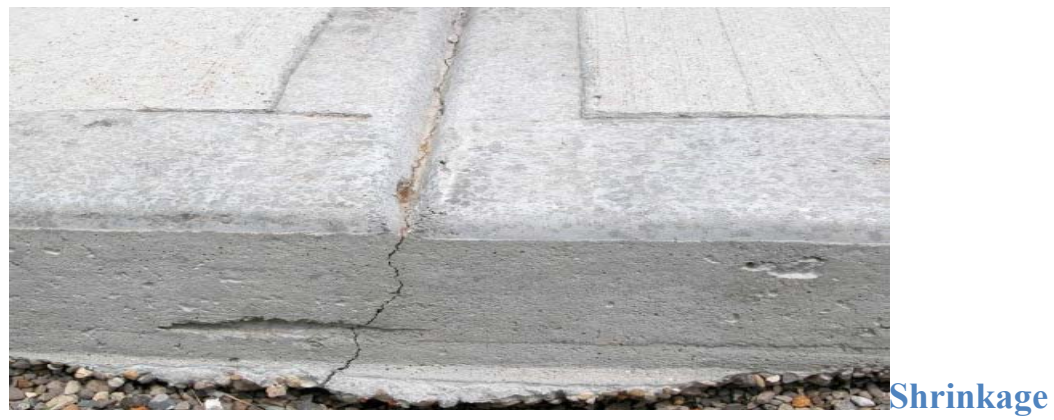
crack at slab penetration Figure <sup>r</sup> Figure <sup>r</sup> A successful crack control joint

To combat random shrinkage cracks, control joints (often mistakenly referred to as Expansion joints) are incorporated into the slab.Control joints are actually contraction joints because they open up as the concrete contracts or gets smaller. They are simply grooves that are tooled into freshconcrete, or sawed into the slab soon after the concrete reaches its initial set. Control joints create a weak place in the slab so that when the concrete shrinks, it will crack in the joint instead of randomly across the slab. (See Figure r).