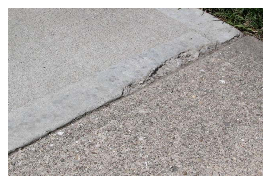
Figure V Expansion joint between these slabs would have prevented chipping

Expansion joint material can also prevent the slab from grinding against the abutting rigid objectduring periods of vertical movement. Duringthese times of heaving or settling, expansion jointmaterial prevents the top surface of the slab frombinding up against the adjacent surface and flaking off (See Figure \vee ).