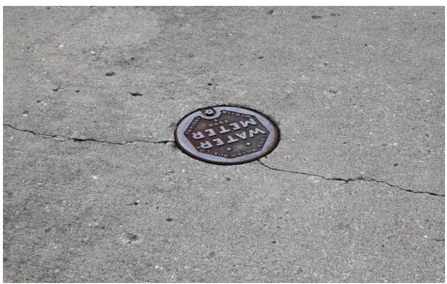
Figure <sup>Y</sup> Shrinkage crack at slab penetration

A rounded object in the middle of a slab creates the same problem as a re-entrant corner. This is commonly evidenced around slab penetrations such as pipes, plumbing fixtures, drains, and manhole castings. The concrete cannot shrink smaller than the object it is poured around, and this causes enough stress to crack the concrete. (See Figure \gamma ).