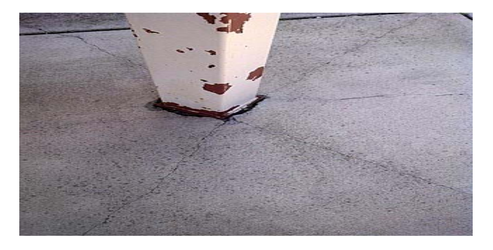
Figure \ Shrinkage cracks originating at re-entrant corner

. However, if an excessive amount of water is added, one can unwittingly reduce the concrete's strength.Plastic shrinkage cracks can happen anywhere in a slab or Wall, but one place where they almost always happen is atre-entrant corners. Re-entrant corners are corners that point into a slab. For example, if one were to pour concrete around a square column, he would create four reentrant corners. Because the concrete cannot shrink around a corner, the stress will cause the concrete to crack from the Point of that corner (See Figure 1).