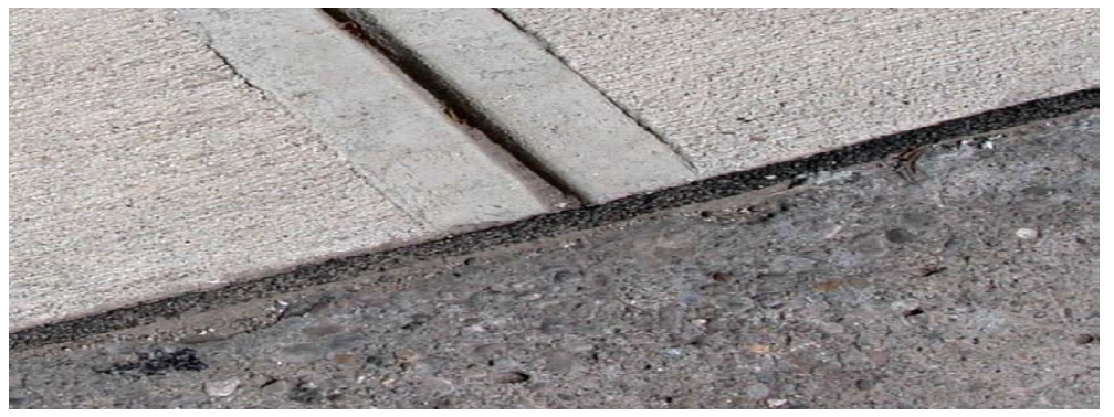
Figure 7 Foam expansion joint separating driveway and

Another reason that concrete cracks is expansion. In very hot weather a concrete slab, like anything else, will expand as it gets hotter. This can cause great stress on a slab. As the concrete expands, it pushes against any object in its path, such as a brick wall or an adjacent slab of concrete. If neither has the ability to flex, the resulting force will cause something to crack. An expansion joint is a point of separation, or isolation joint, between two static surfaces. Its entire depth is filled with some type of compressible materialsuch as tar-impregnated cellulose fiber, closed-cell poly foam, or even lumber See Figure <sup>¬</sup>). Whatever the (compressible material, it acts as a shockabsorber which can "give" as it is compressed. This relieves stress on the concrete and can prevent cracking.